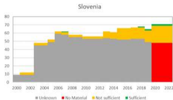
SDG indicator 2.5.1b - local