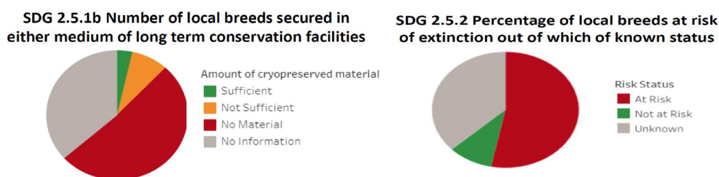
Figure 2: AnGR-related SDG indicators for Europe incl. the Caucasus (source: EFABIS, footnote 16)

The analysis of SDG indicators (Figure 2) shows that the cryopreservation status is known for two thirds of local breeds in Europe. Only 133 local breeds have sufficient material to allow reconstitution in case of extinction (3.5 %). For breeds with known risk status, about 85 % of local breeds in Europe are at risk of extinction.