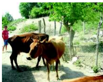
Shkodra Red Cattle