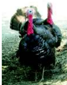
Local Turkey breed - Zadrima