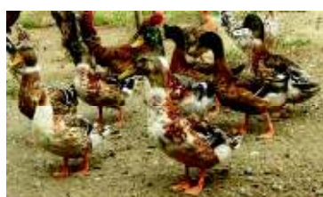
Local duck– Velipoja region