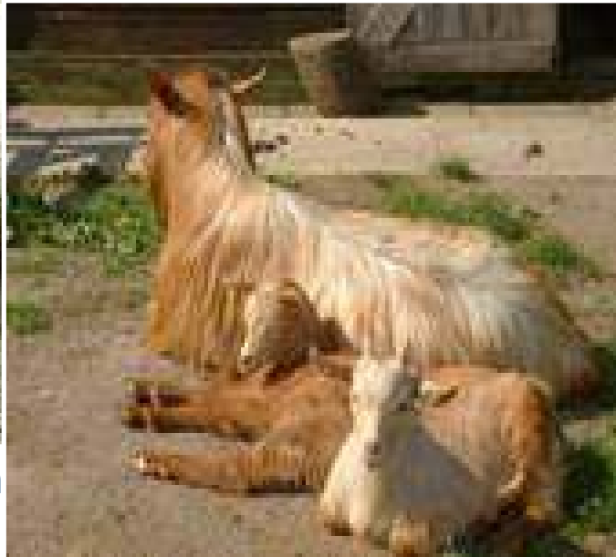
Golden Guernsey Bucks Peaclone Pure Gold