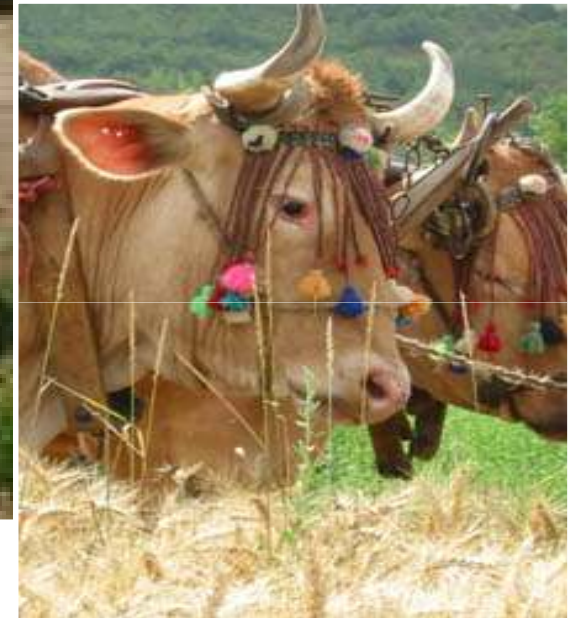
Tortonese Cattle Breed